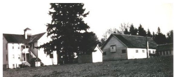
Additional classrooms behind building.