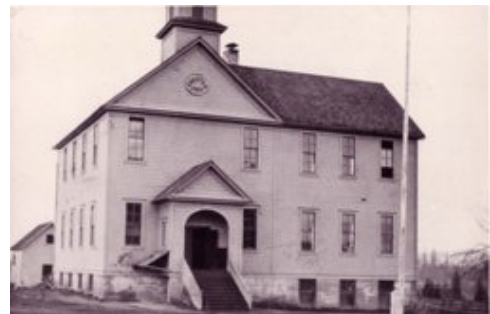
Old school after being raised up to add floors.