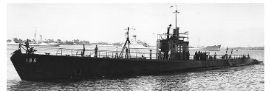
Photo above: The USS Stingray was one submarine that Monty was assigned to.